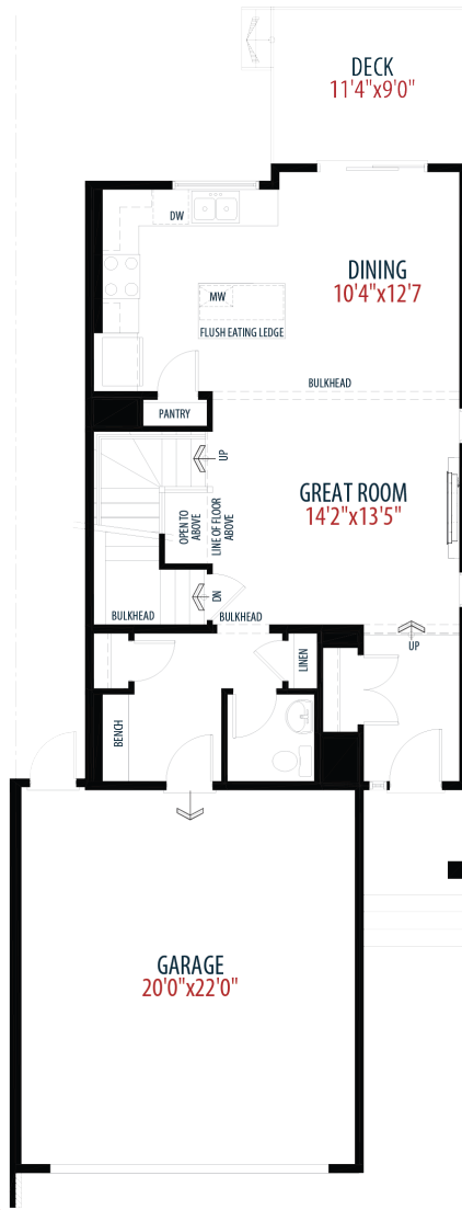
Main Floor 781 sq ft