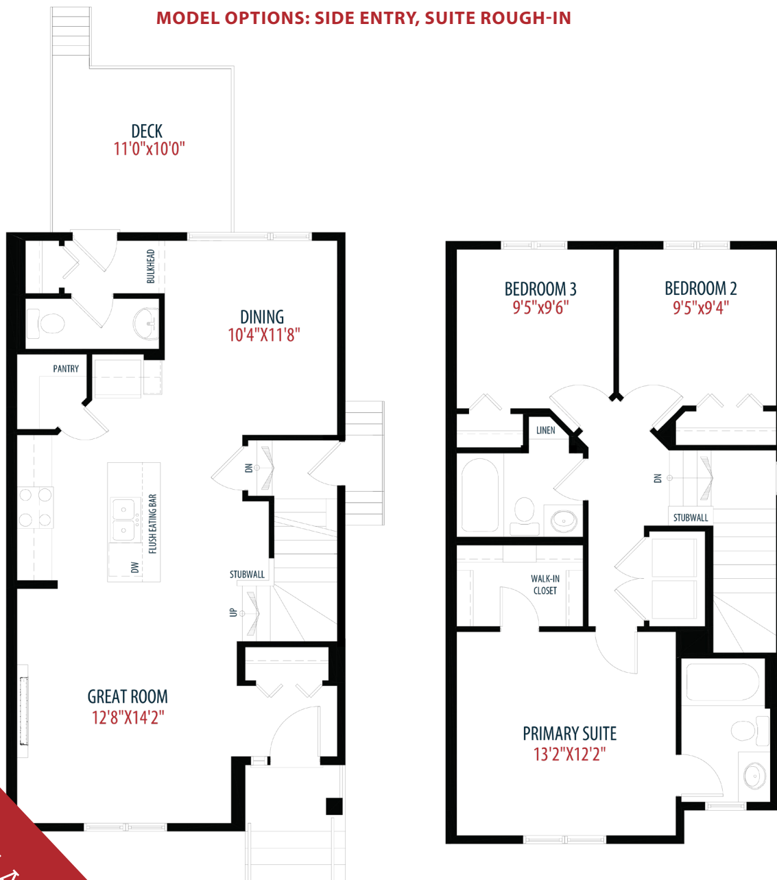
Main Floor 696 sq ft

MODEL OPTIONS: SIDE ENTRY, SUITE ROUGH-IN